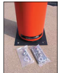
Mounting Hardware Included

*Bollard Colors: Red, Orange Yellow, Blue, White, Gray & Black - Reflective Tape Colors: Red, Orange Yellow, Blue, & White